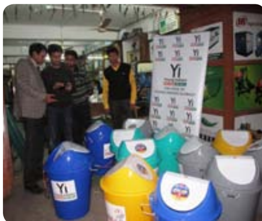
Free dustbin distribution - Siliguri