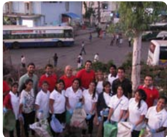
Clean up drive at RTC Complex - Vizag