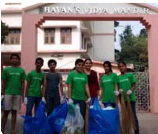
Cleaning the street leading to the school - Kochi