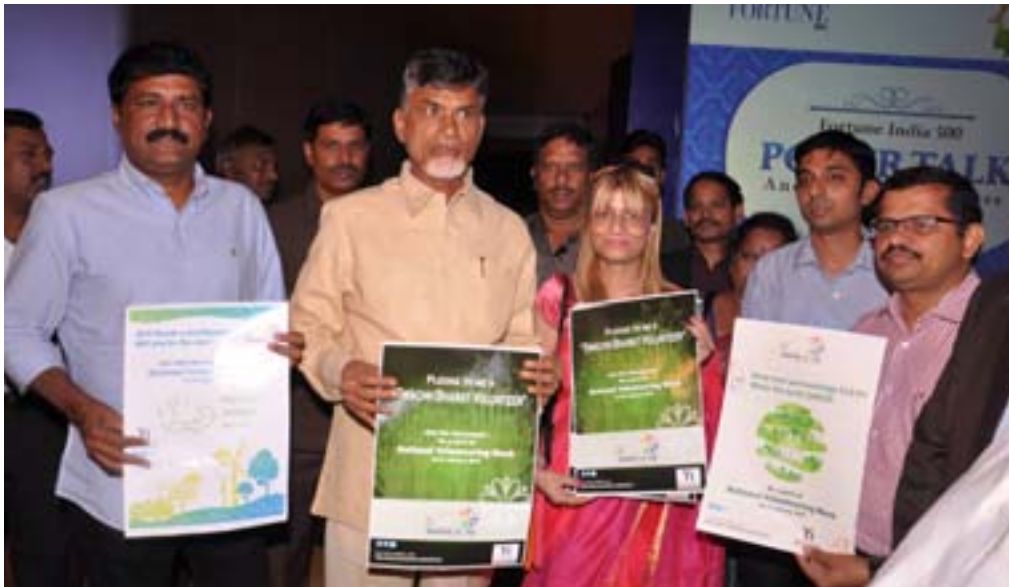
Mr. N Chandrababu Naidu, Honorable Chief Minister of Andhra Pradesh unveiling the poster of National Volunteering Week.(L-R) Mr Ganta Srinivas Rao, State Minister of HRD, Mr N. Chandrababu Naidu, Hon'ble Chief Minister Andhra Pradesh.