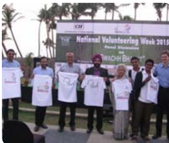
Launch of T Shirt - Vizag