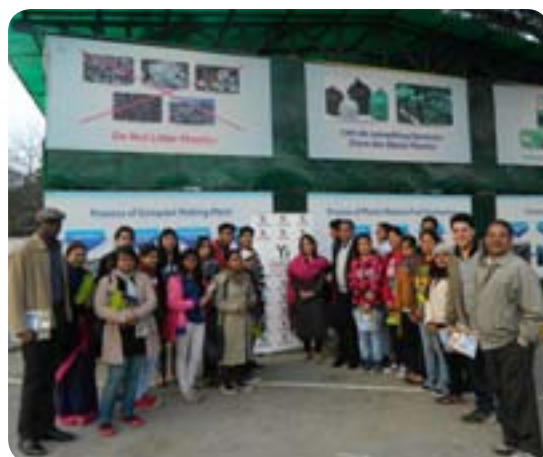
Launch of T Shirt - Vizag