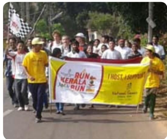
Run Kerala Run Marathon - Trivandrum