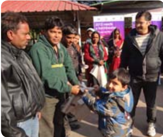
Acknowledging the street cleaning employees of Nagar Nigam - Bhopal