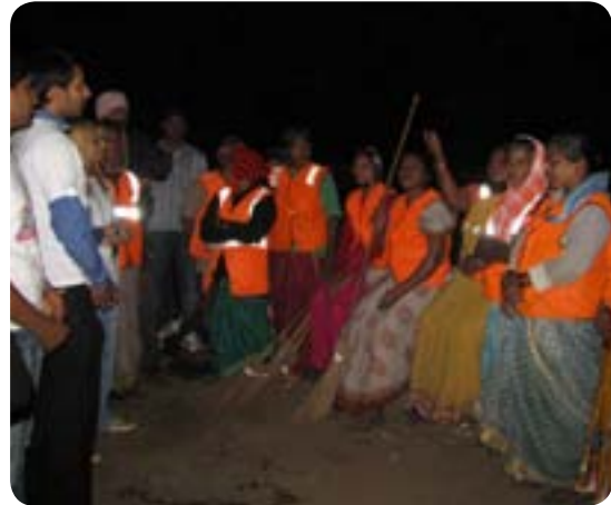
Awareness on Swachh Bharat and Thanking GVMC Sweepers - Vizag