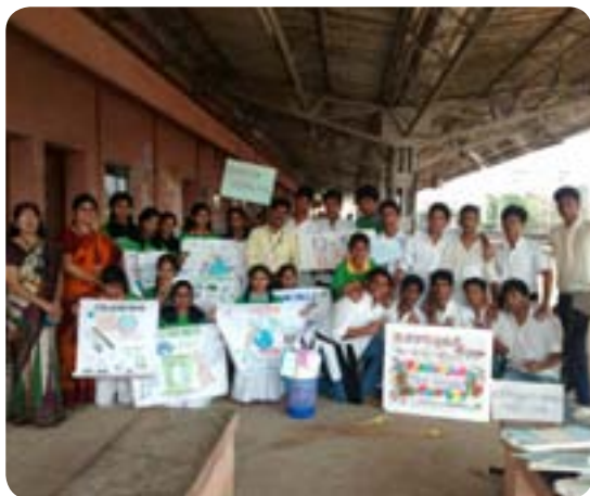
Street play on Swachh Bharat - Kochi