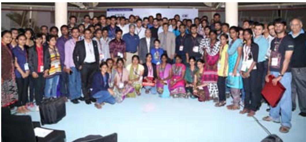
Participants of India@75 Hackathon at IBM premises, Bengaluru

A special jury prize were was awarded to team “Digital Dreamers” from Chennai that worked on app “GovtforU” which proposes to bring various government services and citizens on a common platform – from requesting an appointment with a local ward councilor to a real time feed on various government policies.