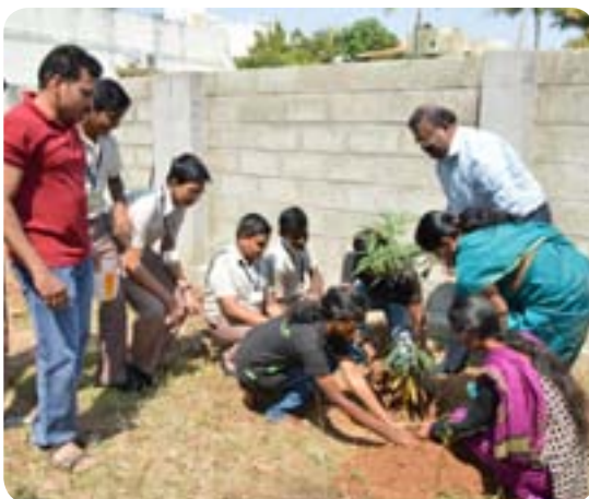
Sapling Plantation by school students - Madurai