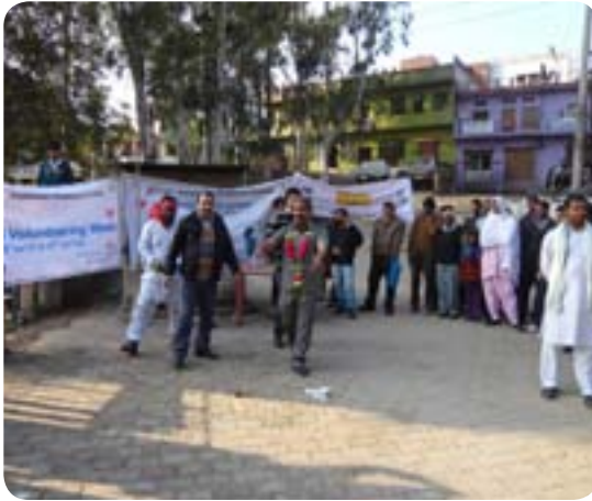
Nukkad Natak on Swachh Bharat - Solan