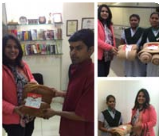
Felicitation to the cleaning staff - Bhopal