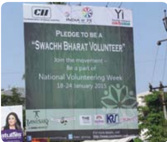
Release of Hoardings on NVW - Vizag