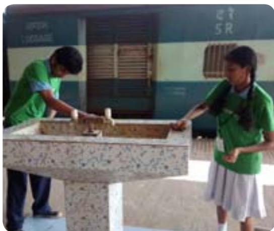
Cleanliness Drive at Tripunitura Railway Station - Kochi