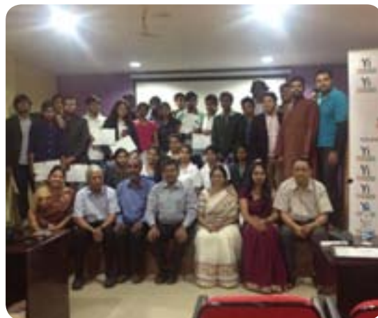
Think for India Program at ROOTS Business School - Hyderabad