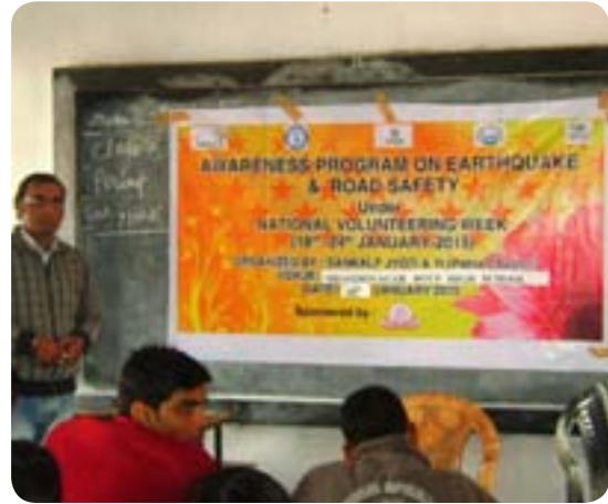
Awareness Program on Road Safety