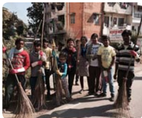
Cleaning the street leading to the school - Kochi