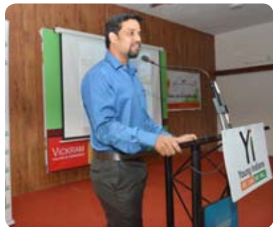
Session on Green Activism - Madurai