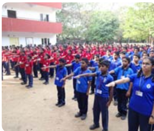
E-waste Awareness Session - Chennai