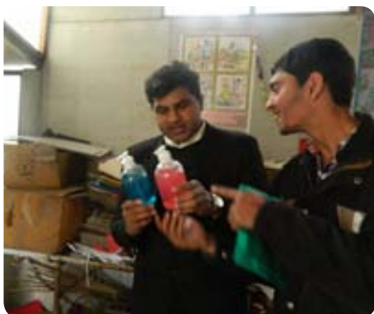
Interactive Session with special children on Importance of Cleanliness - Delhi