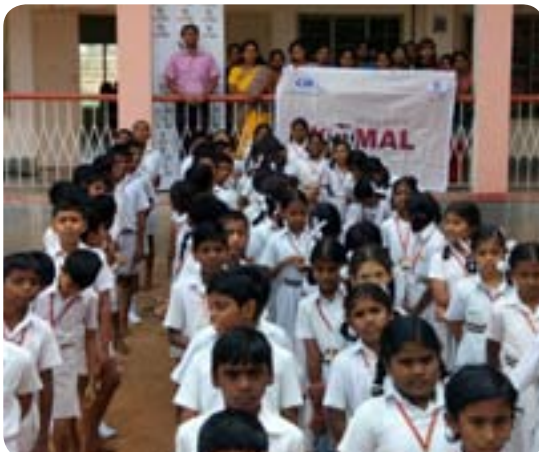
Awareness Session on Child Sexual Abuse under Project KOMAL - Trichy