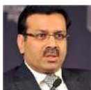
Mr Sanjiv Goenka Chairman, RP-Sanjiv Goenka Group