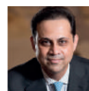
Mr Sanjiv Bajaj President-Designate, CII & Chairman and MD, Bajaj Finserv Limited