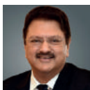
Mr Ajay Piramal Chairman, Piramal Group