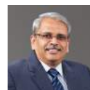
Mr S Gopalakrishnan Chairman, Axilor Venture & Co-Founder, Infosys Limited