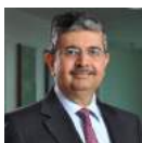
Mr Uday Kotak Managing Director & CEO, Kotak Mahindra Bank Limited