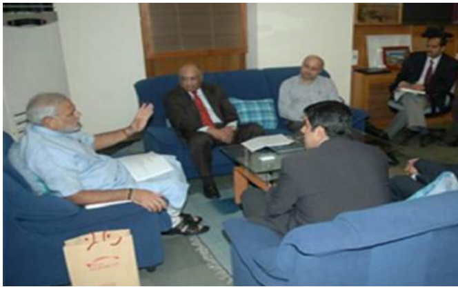
CII presenting the document to Shri Narendra Modi, then the CM of Gujarat