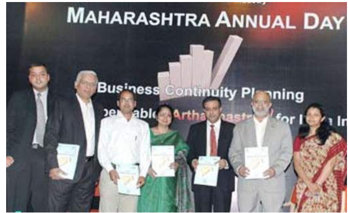
Maharashtra unveils its State Vision Document