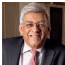
Mr Deepak Parekh Chairman, HDFC Limited