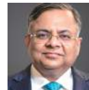
Mr N Chandrasekaran Chairman, Tata Sons